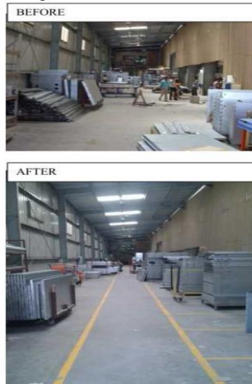
Fig (1): changes in the shop floor before and after

for them. After that all the 5 rules of the 5S has been implemented on the shop floor in a systematic order. We appointed one of the workers as a person responsible for the implementation of 5S for that department and so with the other departments of the industry. This resulted in great changes on the shop floor.